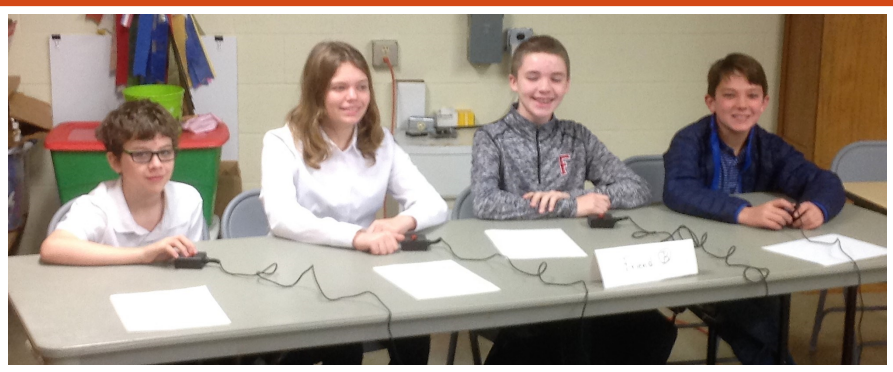
SHELBY-RISING CITY HIGH SCHOOL 2018 HOLIDAY TOURNAMENT

Thursday, December 27 and Friday, December 28, 2017 GIRLS BRACKET